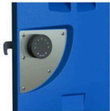
Digital Lock Ideal for Hire Lockers