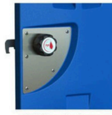
RFID Cam Lock Turn to open