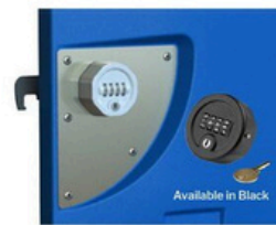
Combination Lock Available in Black