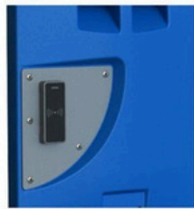
RFID Lock Pop Open